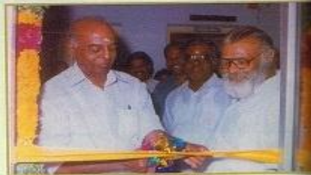
Computer Lab Opening - 2000