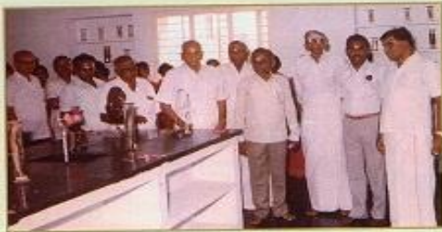
1992 - Lab Opening