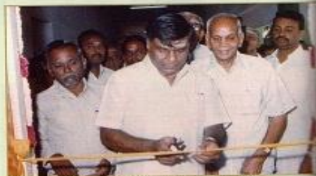
1992 - Science Lab Opening