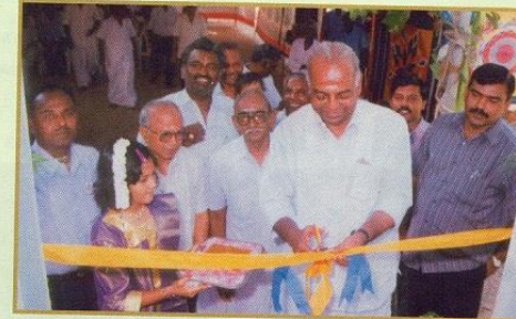
New Block Opening - 2000