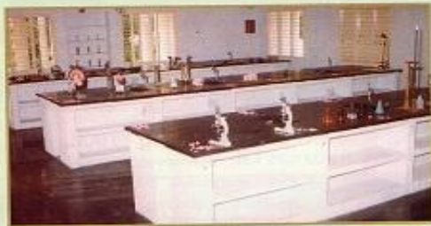
August-1992 Opening of the New Laboratory