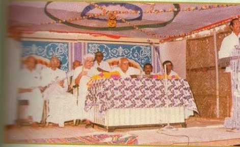
New Building Inaugural Ceremony - 1990