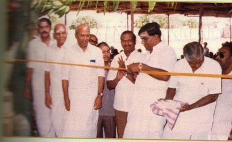
1990 - New Block Opening