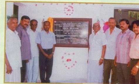
New Building Opening Ceremony - 2000